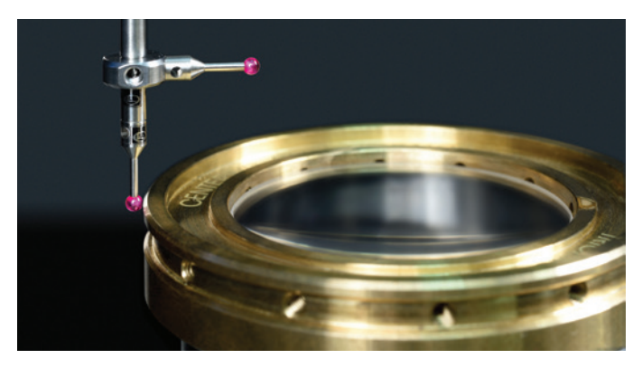
Unequaled repeatability and scalability result from integrated metrology in the ATS 200 alignment turning machine

Complete Optical Solutions: By bringing together expert system design, vertically integrated state-of-the-art manufacturing capabilities, and extensive optical metrology under one roof, we can take on projects at any level of design maturity, and quickly bring them to market.