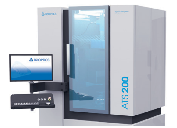
High capacity and precision is achieved with state-of-the-art alignment turning technology

Engineering Excellence: Through our innovation, in-depth know-how, and unique set of technical competencies, our designs represent the very best solution for each application. We design and accurately simulate "as-built" optomechanical imaging systems, including stray-light and FEA thermal and mechanical stress analyses. Coupled with advanced component-through-assembly fabrication experience and system-level thinking, this approach ensures that the end-product is fully optimized for manufacturability, cost, and performance, and can be directly transitioned to production.